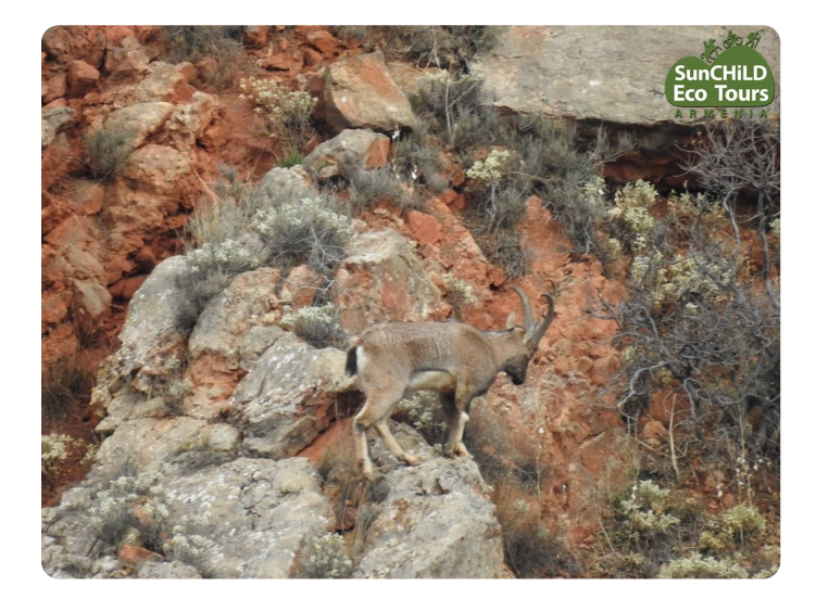
AMD 60,000 – full day including picnic lunch (7-8 hours)